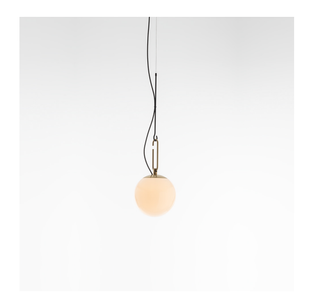
IP 20 ☐ 《《 ( € Dimmerable: +①-